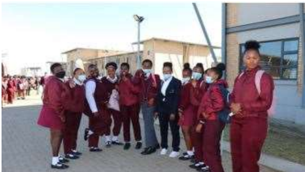
high School students with the SRC Media Officer

First ever in the history of the College, Department of Science and Innovation Technology held the Annual Heritage Career Exhibition at Motheo TVET College, National Artisan Academy