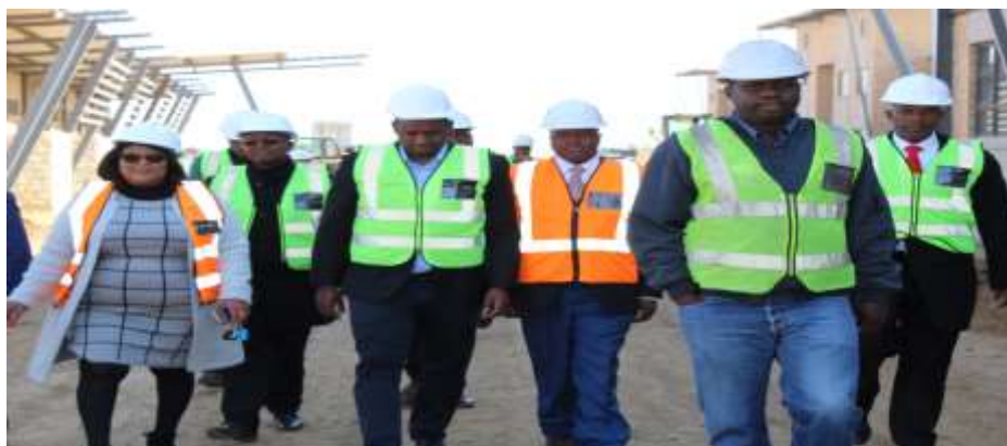
Deputy Minister, Council Chairperson, Principal and College officials at the National Artisan Academy

From the completion of the National Artisan Academy, to celebrating the outstanding work of the 2021 academic year, this student newsletter brings you all the exciting and worthwhile achievements and milestones that Motheo TVET College has achieved to date. In so doing we seek to reinforce the idea that you joined a progressive and innovative institution, and for that BE PROUD!