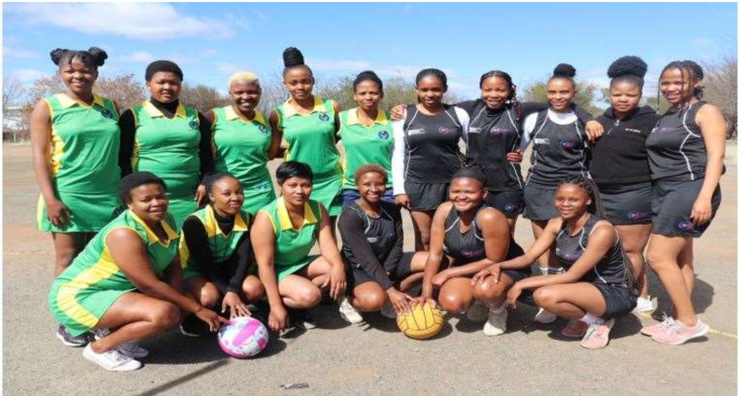
Koffiefontein Campus and Northern Cape Urban TVET College netball

Among the games that the colleges competed against was soccer and netball.