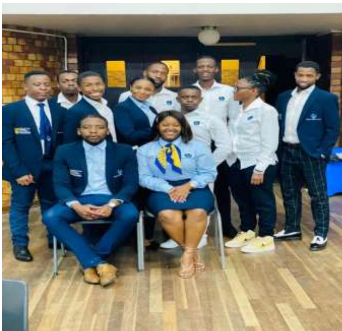
SRC COUNCIL MEMBERS OF 2022/23