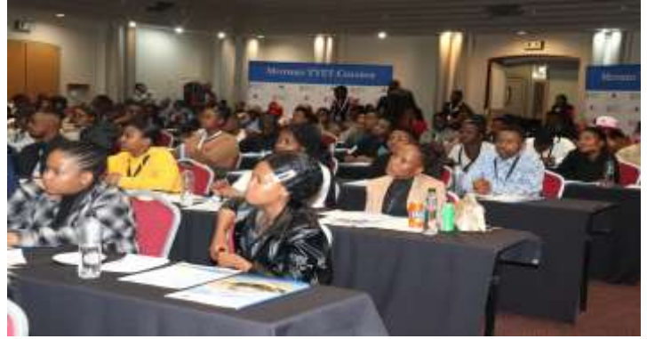
Delegates during the

The highlighted points during this gathering were, ways to improve the student performance in campuses, promotion of healthy lifestyle within student population, Financial Aid issues on disbursement of tuitions and allowances and on blended learning.