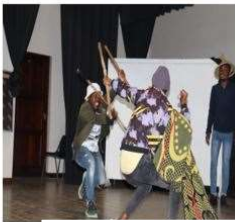
Zastron- ho kalla