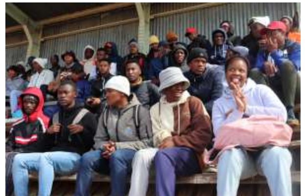
Spectators- Students from both Colleges