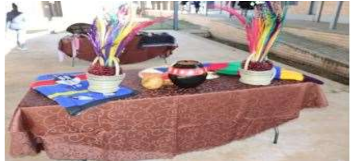
Combination of Swati and Ndebele table set up