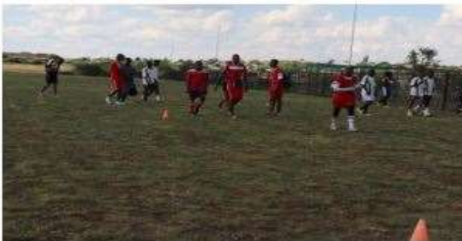
TBN Soccer team and Zastron

Jim Ryun once said, “Motivation is what gets you started. Habit is what keeps you going.”