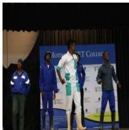
TBN- Gumboots dance