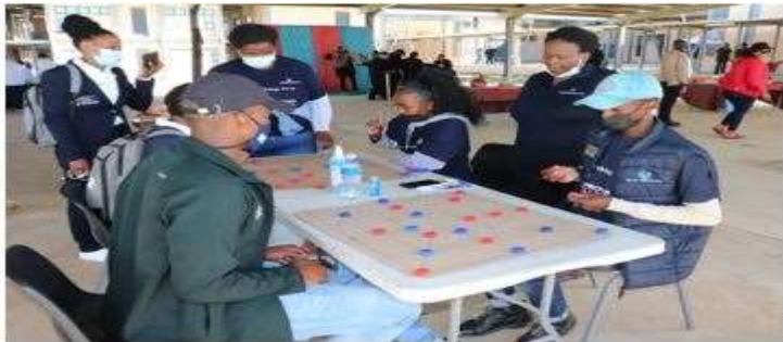
Sesotho game morabaraba played by SRC & peer tutors

Our very students were show casing their crafts at the event. A number of traditional games, meals and attire were presented and enjoyed.