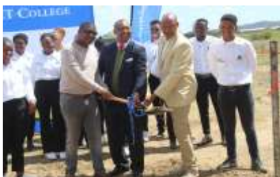
Maritime Diving Pool to be constructed

"Self-Belief and hard work will always earn you success." ~~Virat Kohil~~