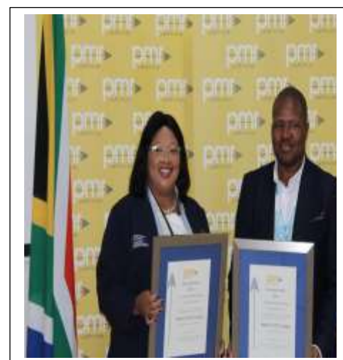
College Awarded PMR Africa Award

"Self-Belief and hard work will always earn you success." ~~Virat Kohil~~