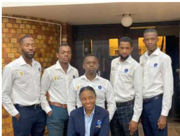
2022/23 CHAIRPERSONS' LEAGUE